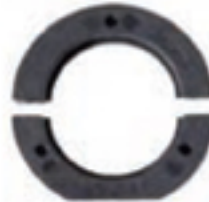
1.5" Hose Swivel End and Collar Adapter ordered separately