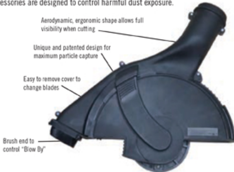
Dust Hood for 4-5" Grinders

Pullman-Ermator's patented Dust Hoods are designed for capturing dust when cutting with an angle grinder. Most commonly used in the masonry and concrete industries. From tuck pointing to crack chasing, our accessories are designed to control harmful dust exposure.